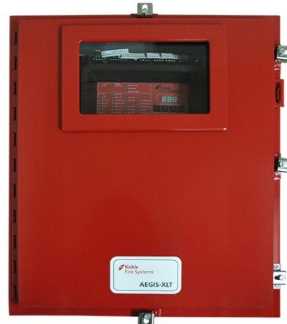
AEGIS-XLT (NEMA 4)

For Commercial, Outdoor (Weatherproof) and Industrial (Dust Tight and Oil Resistant) applications, the AEGIS-XLT is available in NEMA 4 and 12 versions. Both versions can be equipped with an optional heater for operation below 32 degrees F. The NEMA 12 enclosure has a door mounted handle for easy access.