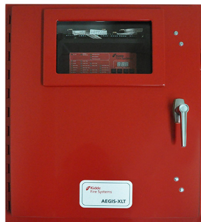
AEGIS-XLT (NEMA 12)